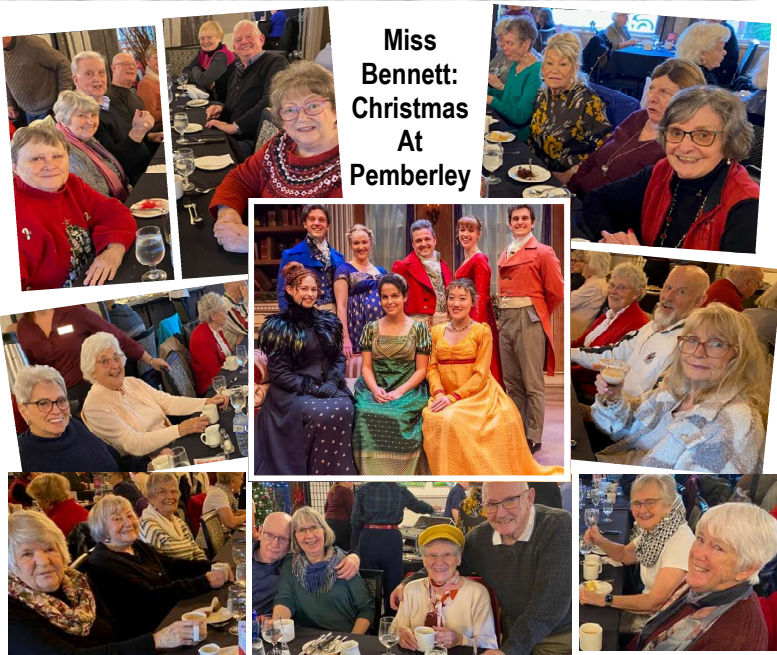
Miss Bennett: Christmas At Pemberley

We use two travel agents to assist in planning longer, more detailed trips. Square 1 Travel in Courtenay and Island Travel in Campbell River. We look forward to working with them again in 2025.